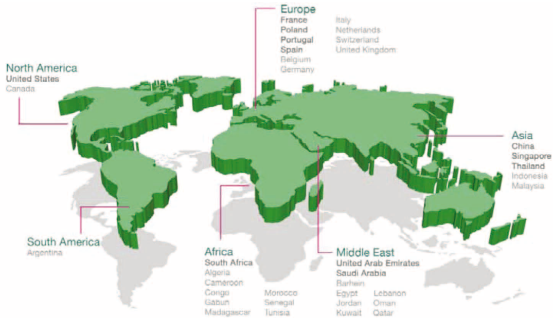
Sage offices supporting Sage ERP X3 Sage ERP X3 resellers

Whether your project is centralised or locally-driven, you will find a Sage team able to support all of your branches locally as well as to provide you global assistance and reporting.